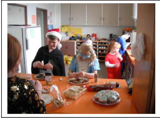
Getting ready for the party!!!