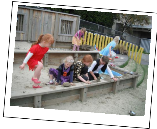
Halloween Party fun – inside and outside